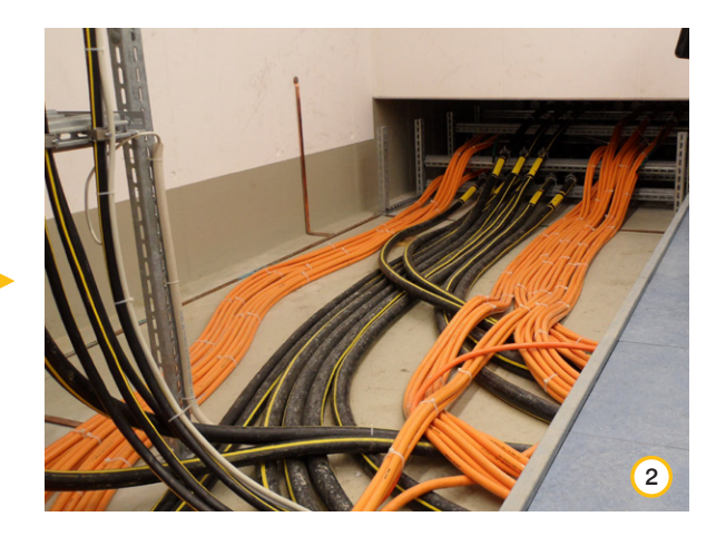
Underground supply cable to the GIFAS floor boxes (type: PIAZZA special).