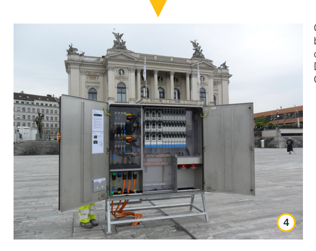
GIFAS 800 A distribution cabinet with robust, rustproof design. Feeds 2x400 A, connectable to PowerSAFE Panelbox. Direct output via NH and connectable CEE 125 + 63 A