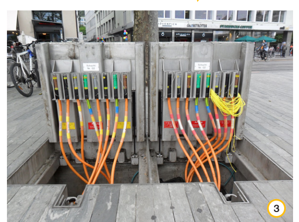
PIAZZA floor box with individual conductor connections, connects to GIFAS PowerSAFE 800 A system.