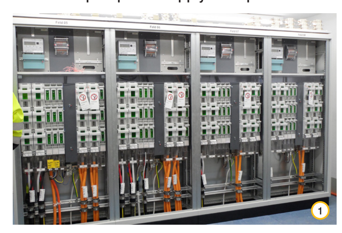
Distribution centre underneath Sechsläuteplatz